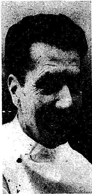
STUDYING BEHAVIOR: Dr. José M. R. Delgado in his office at Yale University School of Medicine.

Switzerland used a similar set-up to stimulate various cerebral regions in conscious cats. He showed that electrical currents could influence the animal's posture, balance, movement and such basic psychic manifestations as fear and rage.