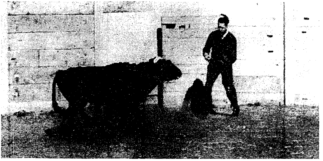
Bull, halted in mid-charge by command from Dr. Delgado's transmitter, raises dust cloud

He has been working in this field for more than 15 years. Techniques that he and other scientists have recently developed have been refined to the point where, he believes, "a turning point has been reached in the study of the mind."